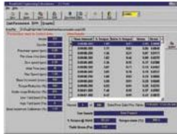
EZ-Yield Data Collection

EZ-Yield software is included with all YR-1 Yield Stress Rheometers and allows for simple data collection on a PC. Collecting data affords you a record of all your valuable testing results.